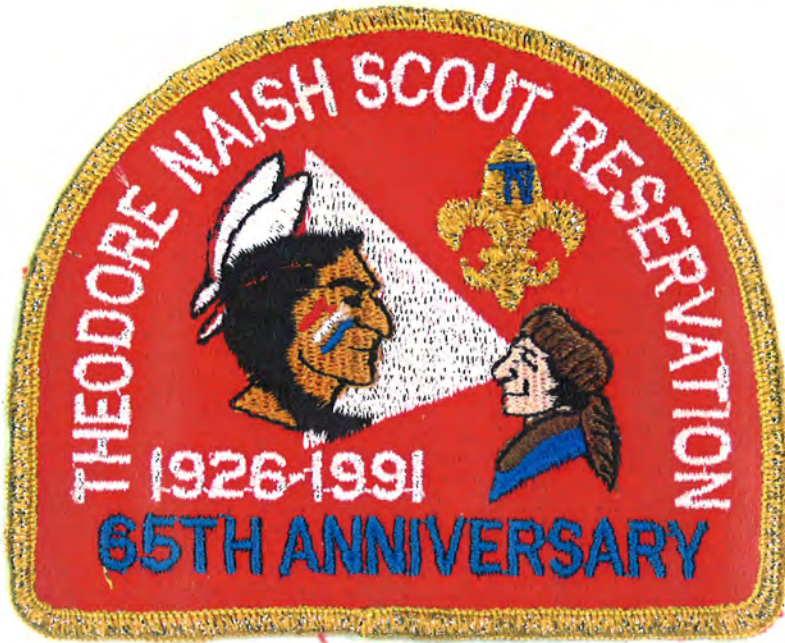
65 TH ANNIVERSARY