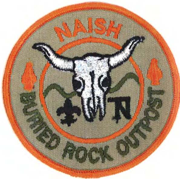
NAISH BURIED ROCK OUTPOST