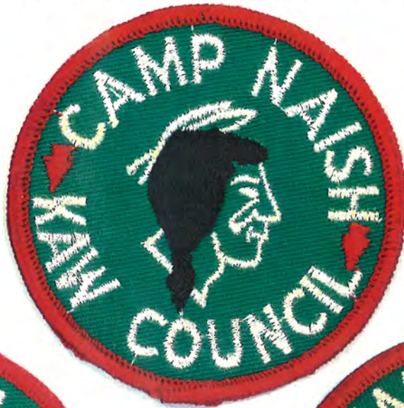
NAISH-KAW COUNCIL SOLID BLACK HAIR