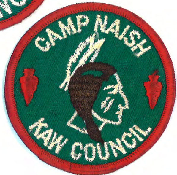
NAISH-KAW COUNCIL BROWN HAIR-PLASTIC BACK