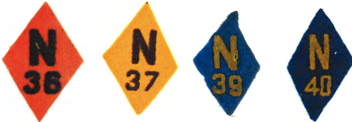
EARLY NAISH FELT PATCHES