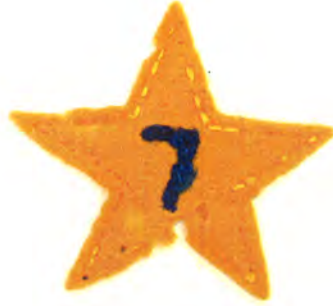
1934 SUMMER CAMP PATCH ISSUED BY TROOP 7-KCK