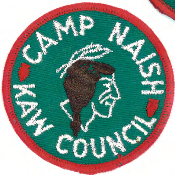
NAISH-KAW COUNCIL THIN BROWN HAIR